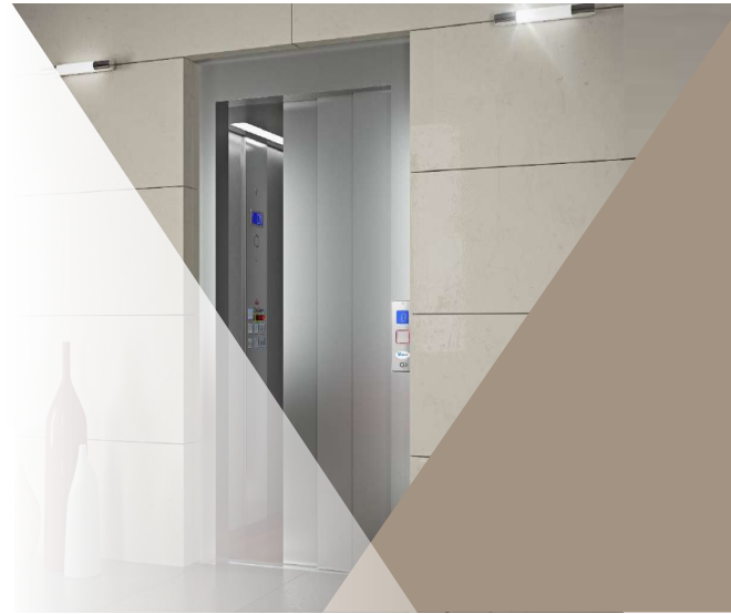
3 speed telescopic doors