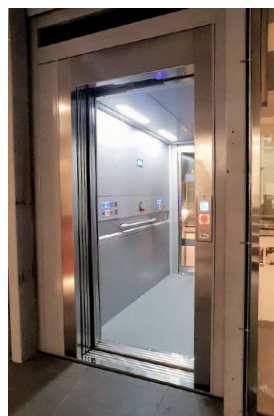
Gartec 8000 Stretcher Lift in Glass