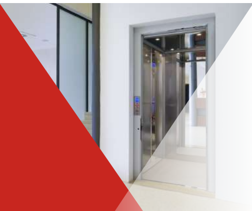
2 speed telescopic doors