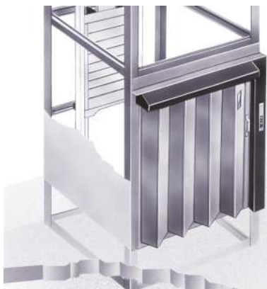
Space-saving concertina shutter leaf gate – can be installed as an optional extra.

To protect loads during travel a collapsible picket gate, electronically interlocked for safety, is available if required.